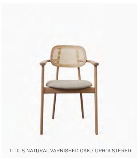
TITUS NATURAL VARNISHED OAK / UPHOLSTERED