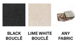
BLACK BOUCLÉ LIME WHITE BOUCLÉ ANY FABRIC