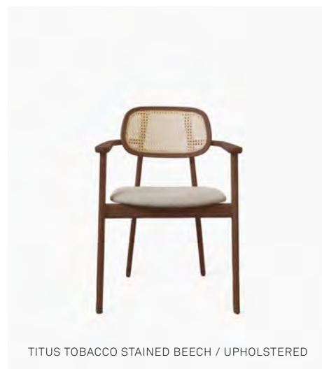
TITUS TOBACCO STAINED BEECH / UPHOLSTERED