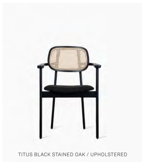
TITUS BLACK STAINED OAK / UPHOLSTERED