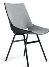
Seat and back upholstery